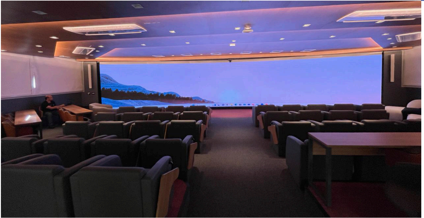
AIC2024 Venue Auditorium

Best student papers will be awarded with the AIC's Student Paper Awards. The goal of this scheme is to encourage students to present their work at the AIC meetings and to benefit from interaction with the international color community. Applications must be substantially related to the subject of color, but may be based in any discipline or mix of disciplines. Both research-based and practice-based work will be considered. There are six awards given, with a money prize for the winning, first runner-up and second runner-up. An additional three papers will be awarded as honorable mention. All six winners will be guests at the Conference Gala Banquet and will have their papers published in a special issue of the JAIC. For more details please refer to the AIC Student Paper Awards guidelines.