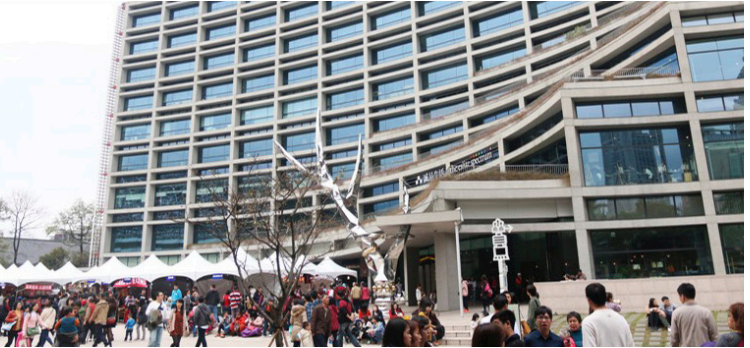
The Taipei New Horizon building in the Songshan Cultural and Creative Park